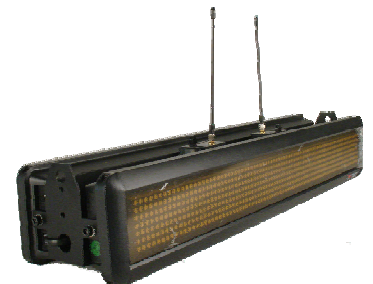
SL7x80TC Double Sided, Chain Mount